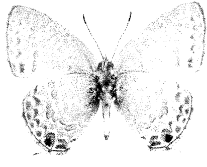
Figure 2. Underside of Catopyrops ancyra almora ♂; TAIWAN: TAIDONG Co., Lanyu Is., Langdao, VIII. 18/22. 1998, Coll. C. C. Lu & C. Y. Hung (NTNU).