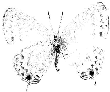
Figure 4. Underside of Catopyrops ancyra almora ♀; TAIWAN: TAIDONG Co., Lanyu Is., Langdao, VIII. 18/22. 1998, Coll. C. C. Lu & C. Y. Hung (NTNU).